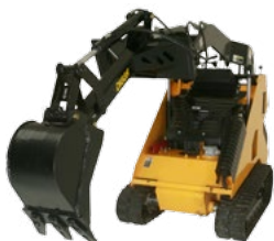
Mini Hoe also available